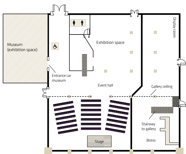
Seating theatre style for 210 persons

Seating classroom style: 30 - 150 persons